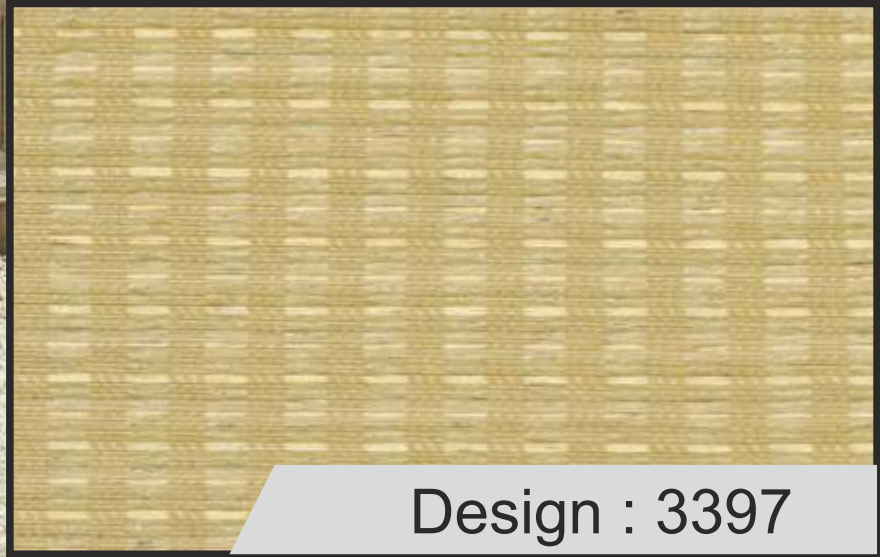
Design : 3397