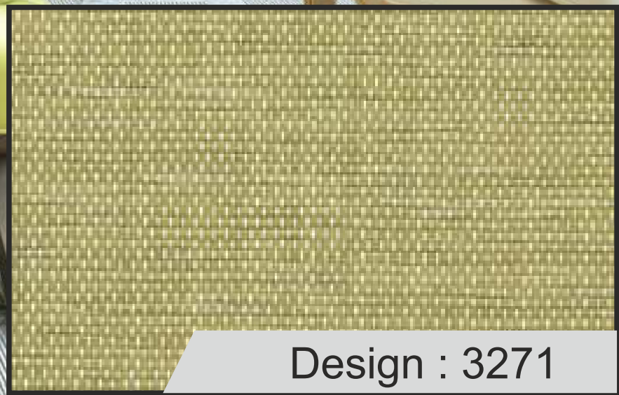
Design : 3271