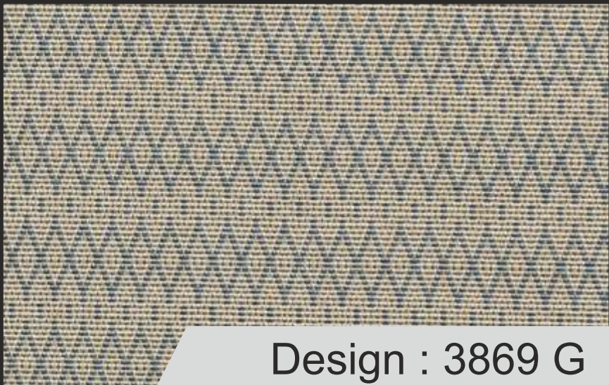
Design : 3869 G