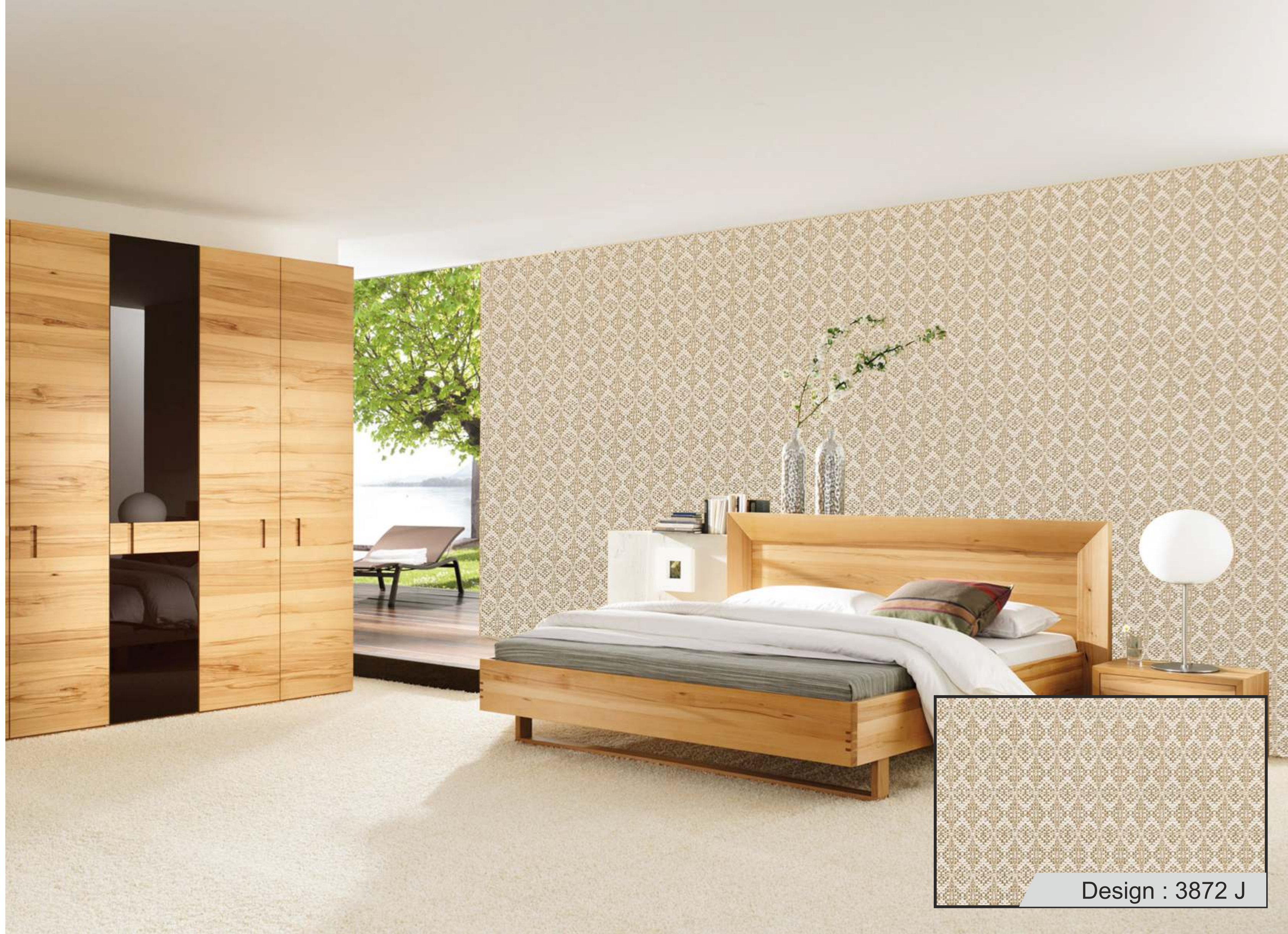
Design : 3872 J