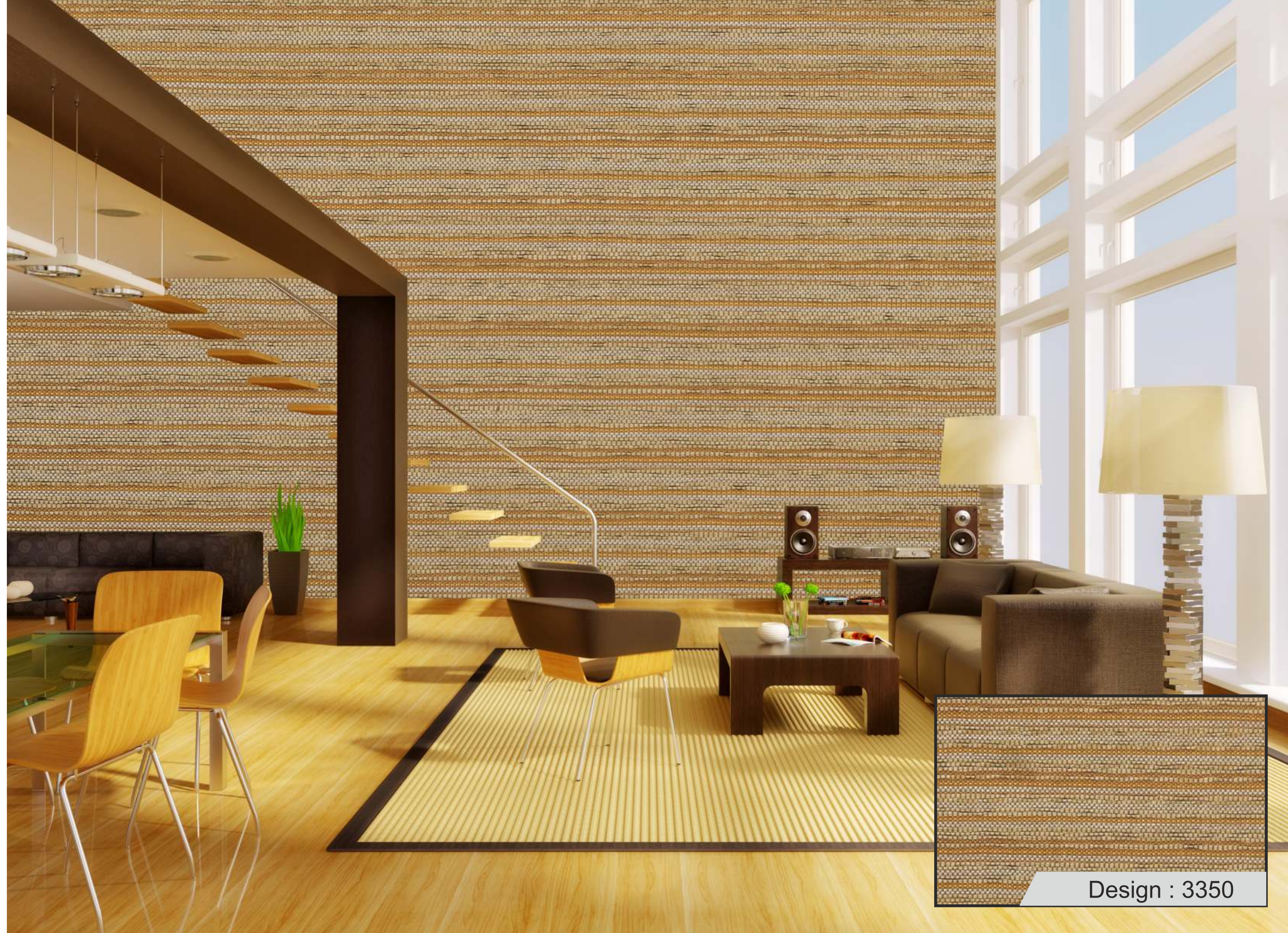
Design : 3350