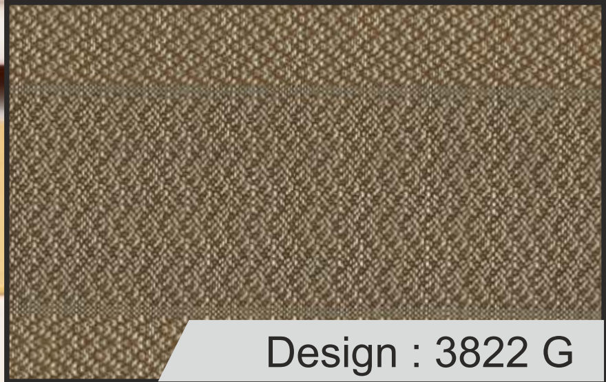
Design : 3822 G