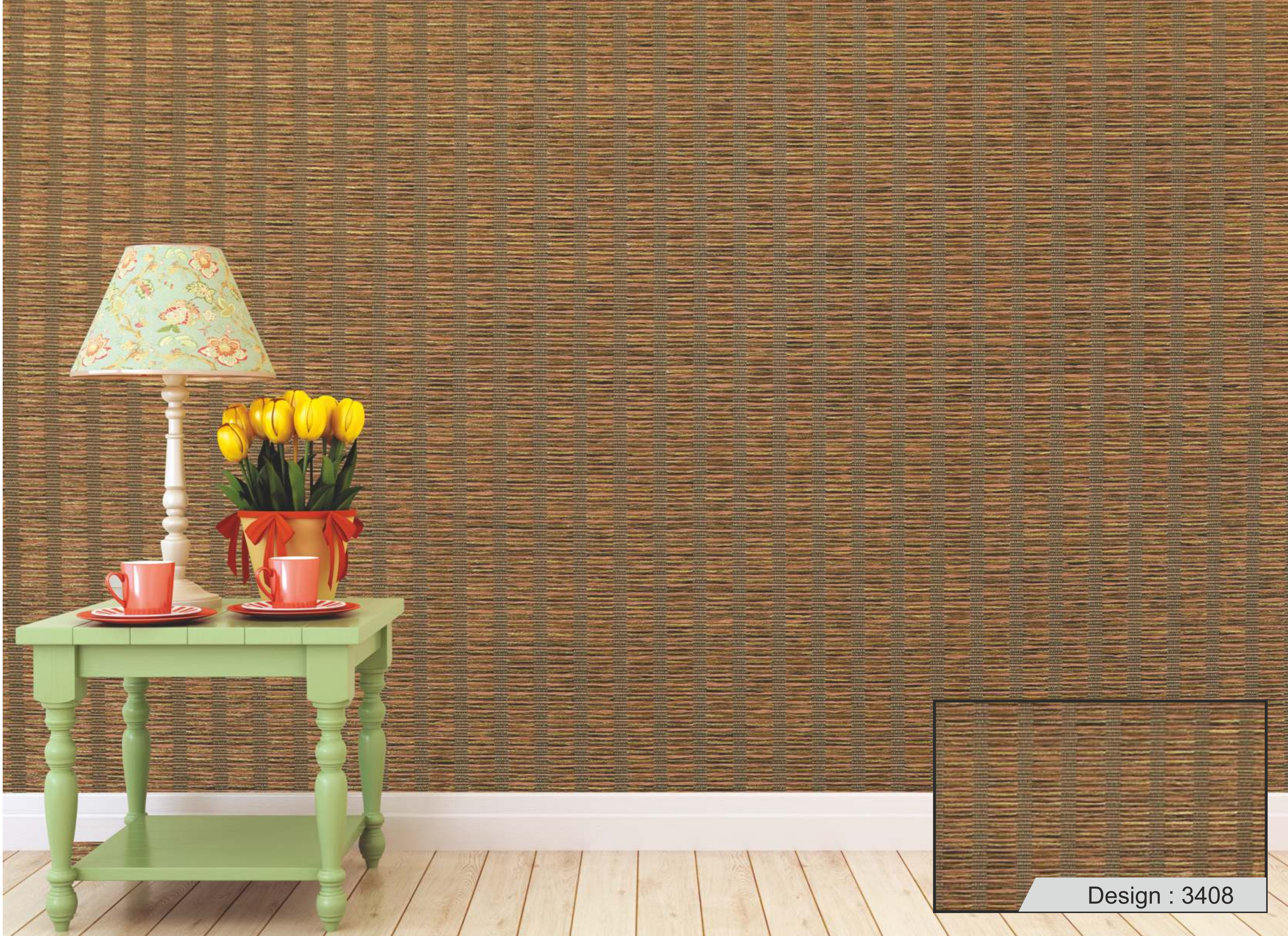
Design : 3408